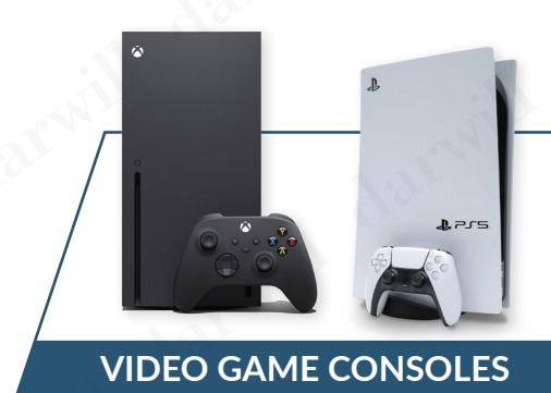
VIDEO GAME CONSOLES